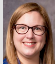
Hon. S. Guillemard Minister of Conservation and Climate Government of Manitoba